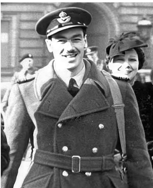
Also locally, on 13 th April 1950 a Vampire crashed at Blackmore, Northcote Lane, Shamley Green